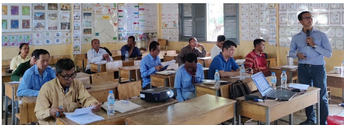
PHOTO 67: TRAINING ON CLIMATE RESILIENCE WATER SAFETY PLAN FOR WATER SUPPLY SERVICE