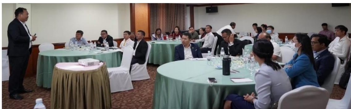
PHOTO 52: WORKSHOP ON STARTUP THE CLEAN WATER LOAN PROGRAM