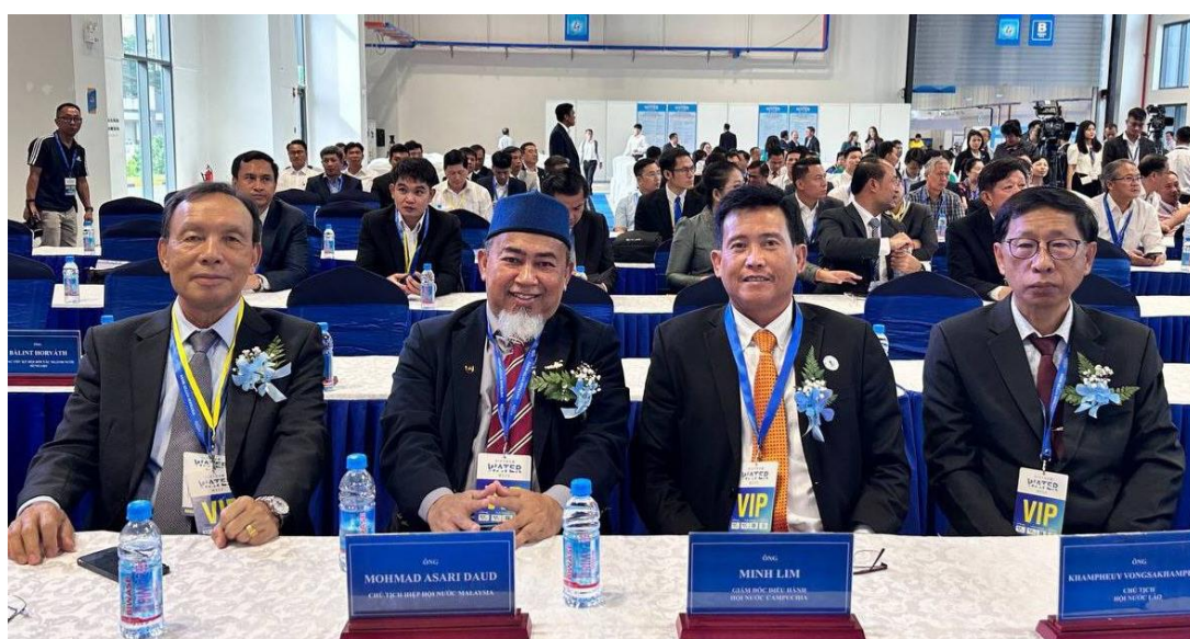
PHOTO 28: DELEGATES FROM CWA PARTICIPATED IN THE VIETNAM WATER WEEK 2023

From September 28-30, 2023, the Cambodian Water Association (CWA) actively participated in the Vietnam Water Week 2023 and the inaugural ceremony of the network in Binh Duong City, Vietnam. This event underscored the significance of collaborative efforts and the exchange of perspectives concerning water supply and wastewater management. Notably, on September 28, 2023, CWA participated in the Southeast Asia Water Utilities Network (SEAWUN) during the proceedings.