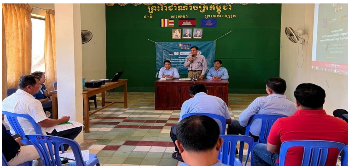
PHOTO 58: A PHOTO TAKEN DURING THE TRAINING ON ROLES AND RESPONSIBILITIES IN CLEAN WATER SUPPLY SERVICE

2. On August 15, 2023, took place at Kampong Seila district office in Preah Sihanouk province, with 22 participants (1 females)