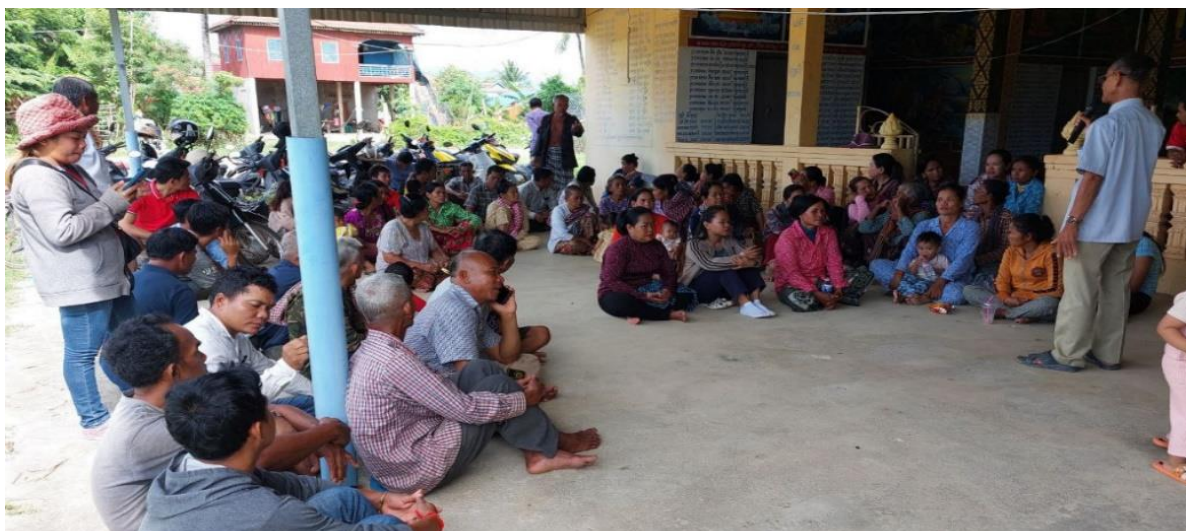
PHOTO 12: ACTING COMMUNE CHIEF OF PREY VIHEAR COMMUNE EXPLAINS THE IMPORTANCE OF USING CLEAN WATER TO THE PEOPLE