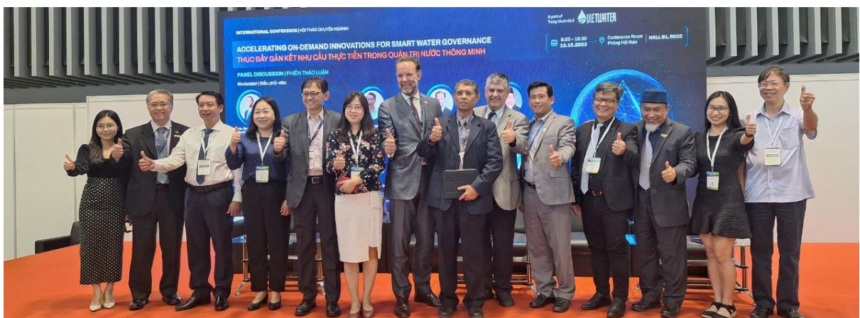
PHOTO 31: PHOTO TAKEN IN THE WATER CONFERENCE AND EXHIBITION “VIET WATER 2023”