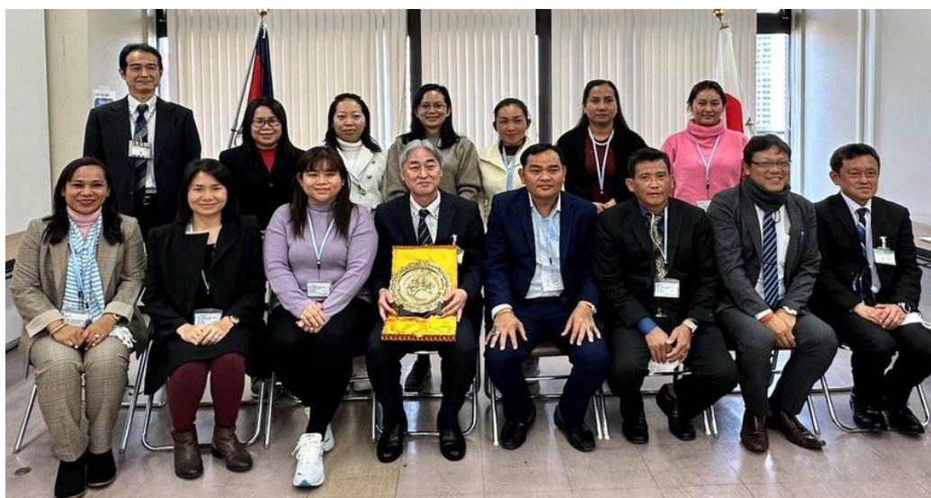
PHOTO 19: A PHOTO TAKEN WITH LEADERS OF WATER SUPPLY AND SEWER SYSTEM OF KITAKYUSHU CITY

the Ministry of Economic, Commerce, and Industry of the Government of Japan, with cooperation and coordination by the Association for Overseas Technical Cooperation and Sustainable Partnerships (AOTS) and the Kitakyushu Overseas Water Business Association (KOWBA).