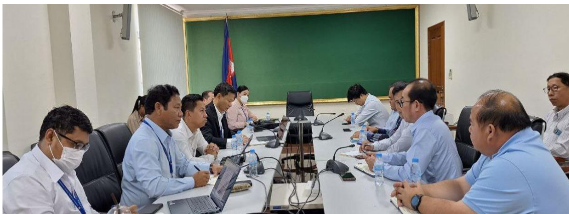
PHOTO 18: MEETING WITH H.E. TAN SOKCHEA, DIRECTOR GENERAL OF GENERAL DEPARTMENT OF POTABLE WATER

On December 19, 2023, Mr. Leng Kheav led CWA staff members to attend a meeting with H.E. Tan Sokchea, Director General of the General Department of Potable Water, to discuss the following points: 1) request for tax exemption on minimum tax, income tax repayment, income tax, and value-added tax (VAT) until 2030; 2) request for appropriate compensation for pipe destruction; and 3) request for subsidy and capital investment support for private water operators.