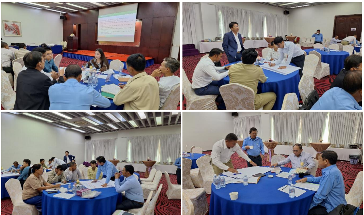
PHOTO 63: DISCUSSION OF THE FOUR TARGET PROVINCES DURING THE WORKSHOP

On December 22, 2023, CWA organized a reflection workshop for the project "Consortium for Sustainable Alternatives and Voice for Equitable Development (Co-SAVED) funded by Aide et Action (AEA)" at Tonle Bassac II restaurant. There were a total of 34 participants (4 females) who attended, representing the MISTI, provincial administrations of Kep, Kampot, Preah Sihanouk, and Koh Kong, as well as 10 district administrations from coastal areas, and Aide et Action (AEA) representatives. The workshop covered topics such as: 1) the project's results, 2) challenges, solutions, and lessons learnt, 3) determining post-project operational activities, and 4) gathering comments.