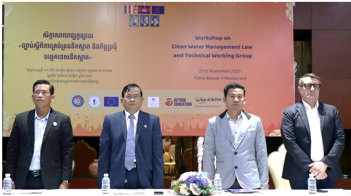
PHOTO 62: DISSEMINATION WORKSHOP ON CLEAN WATER MANAGEMENT LAW AND TECHNICAL WORKING GROUP