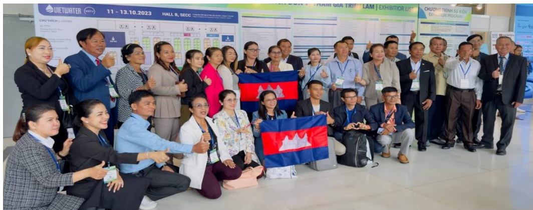
PHOTO 30: CWA DELEGATES JOINED THE WATER CONFERENCE AND EXHIBITION IN VIETNAM “VIET WATER 2023”

From October 10-12, 2023, CWA led a total of 61 members and staff (including 24 females) to join the Vietnam Water Conference and Exhibition 2023 at Saigon Exhibition and Convention Center In Vietnam on “Accelerating On-Demand Innovations for Smart Water Governance”.