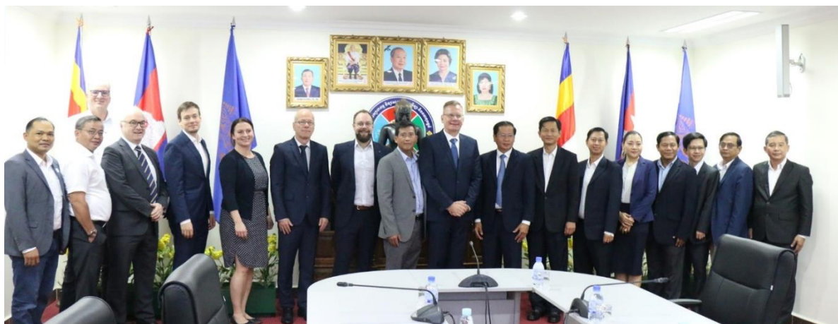
PHOTO 21: A PHOTO TAKEN DURING THE VISIT OF GERMAN DELEGATES TO MISTI