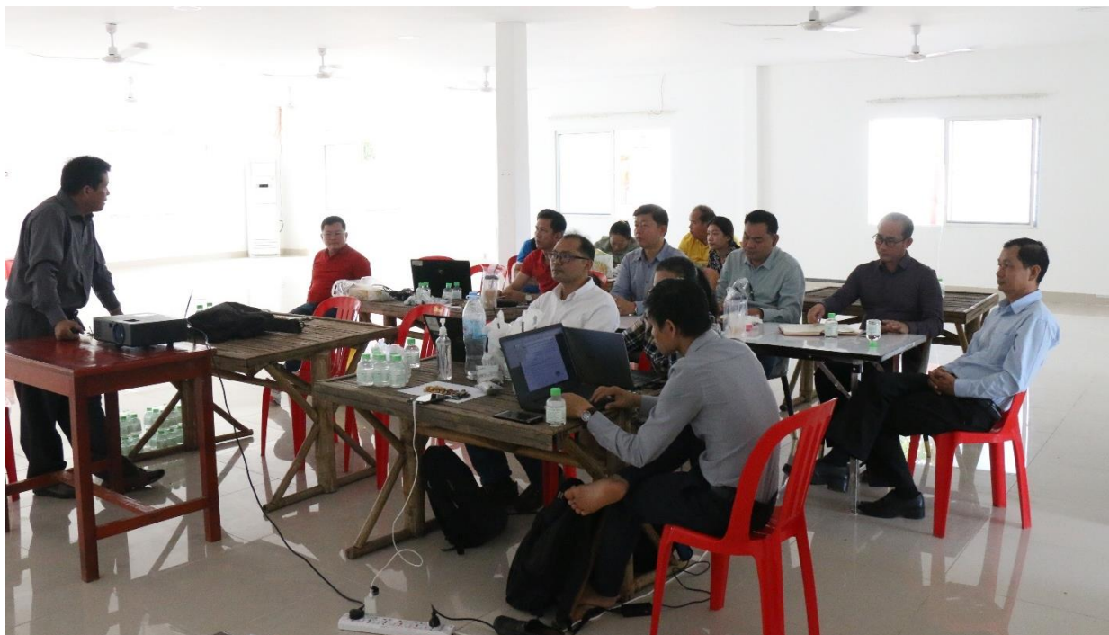
PHOTO 5: REFLECTION MEETING FOR YEAR 2022 AT KAMPOT PARADISE HOTEL

The reflection meeting for 2022 took place from February 2nd to 4th, 2023, in Kampot province, with a total of 15 participants (4 female), including 9 staff members and 6 Board of Directors (BoD) members. The objectives of the meeting were: 1). to present the CWA's accomplishments in 2022, 2). to develop an action plan for 2023, 3). to discuss the main agenda for the upcoming annual general assembly, 4). to evaluate the work done by CWA, 5). to present the staff policies, and 6). to revise the membership contribution fees.