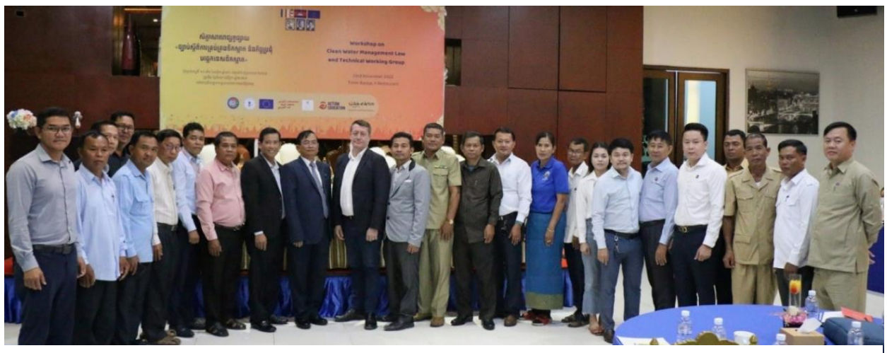
PHOTO 61: DISSEMINATION WORKSHOP ON CLEAN WATER MANAGEMENT LAW AND TECHNICAL WORKING GROUP

On November 23, 2023, CWA collaborated with the General Department of Potable Water to organize a dissemination workshop on the "Clean Water Management Law and Technical Working Group" at Tonle Bassac II Restaurant. The workshop was attended by 27 participants from MISTI, representatives from the provincial administrations of Kep, Kampot, Preah Sihanouk, and Koh Kong, as well as 10 district administrations from coastal areas, and representatives from Aide et Action (AEA). This workshop aimed to provide relevant stakeholders and sub-national authorities with comprehensive insights into the content of the Clean Water Management Law, particularly focusing on the roles and responsibilities of authorities and water operators in delivering clean water services, as well as seeking solutions to water supply issues.