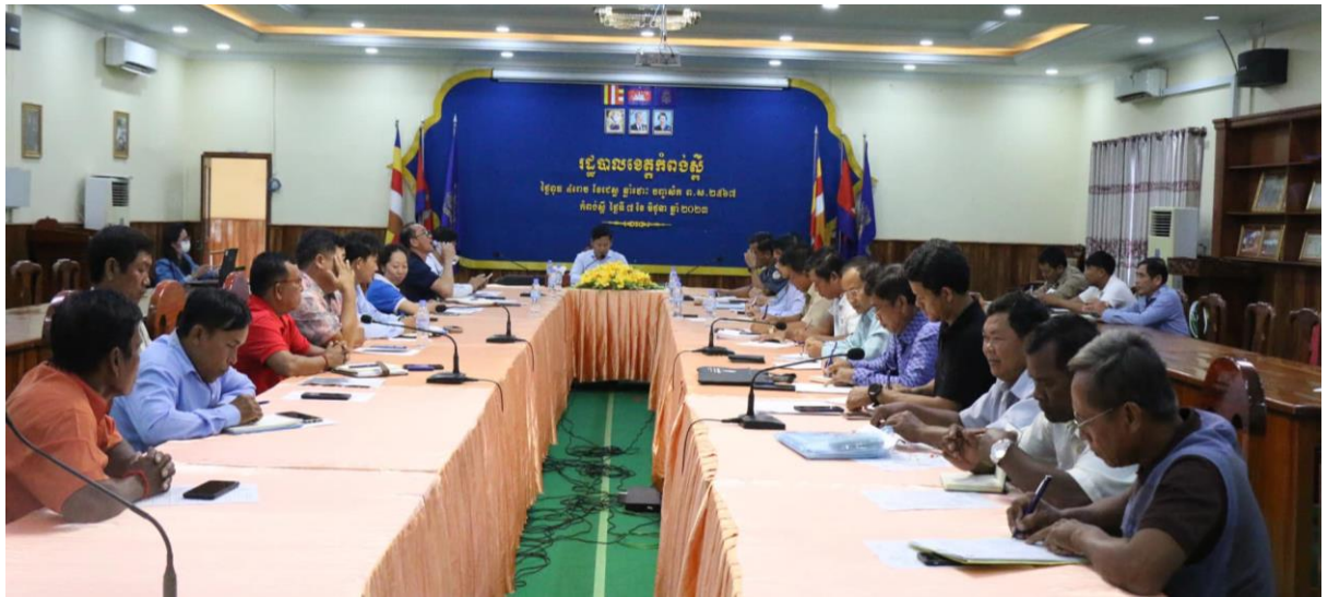
PHOTO 10: CONFLICT RESOLUTION MEETING BETWEEN PRIVATE WATER OPERATORS AND COMMUNITY-BASED