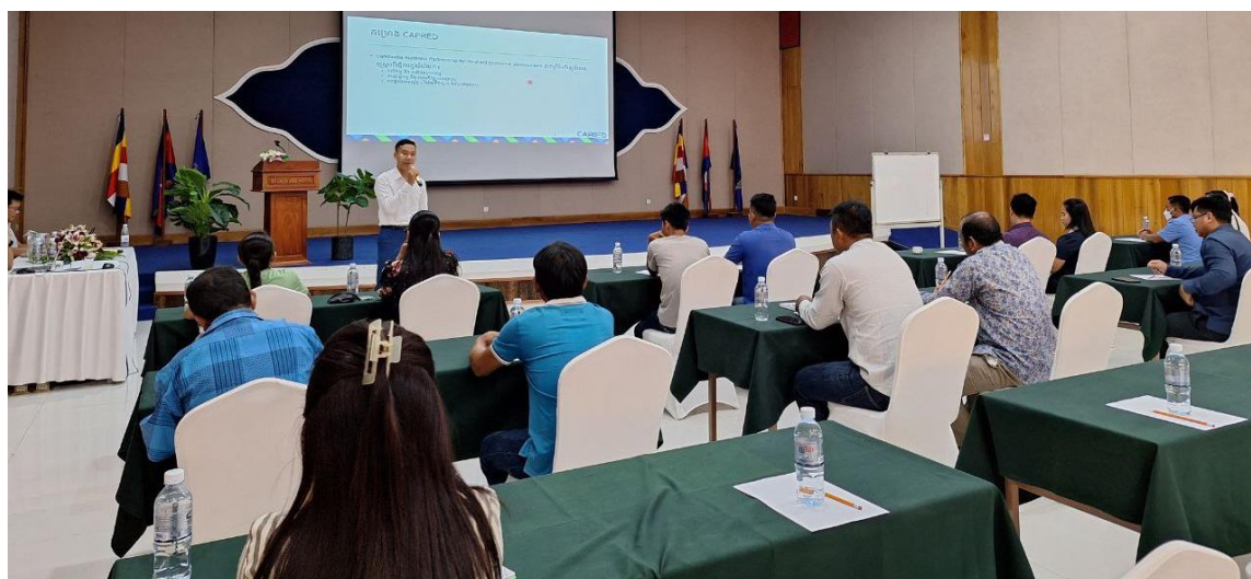
PHOTO 38: PRESENTATION ON BULK WATER BUSINESS MODEL MADE BY CAPRED