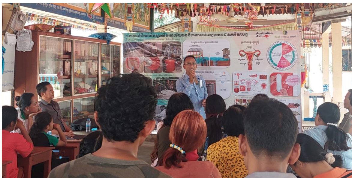
PHOTO 64: PILOT TEST ON THE USE OF EDUCATIONAL MATERIALS FOR COMMUNITY