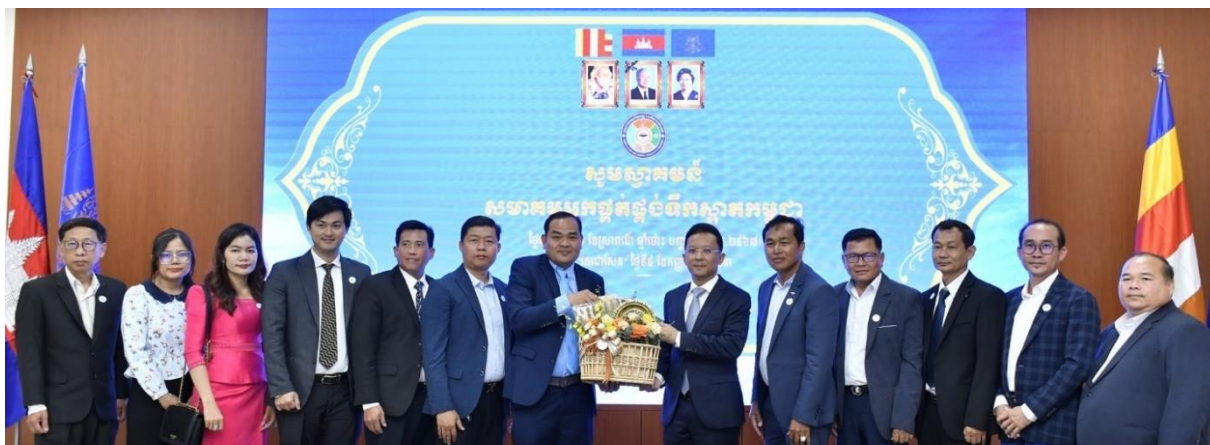
PHOTO 17: COURTESY CALL TO CONGRATULATE H.E. HEM VANNDY, MINISTER OF INDUSTRY, SCIENCE, TECHNOLOGY & INNOVATION

On September 5, 2023, the Board of Directors and management team of CWA conducted a courtesy call to congratulate H.E. Hem Vanndy on the occasion of the National Assembly's vote in support of the Minister of Industry, Science, Technology & Innovation during the 7th term, which took place on August 22, 2023. During the courtesy call, Minister Hem Vanndy provided valuable feedback to assist CWA in better implementing its activities and developing its strategic plan.