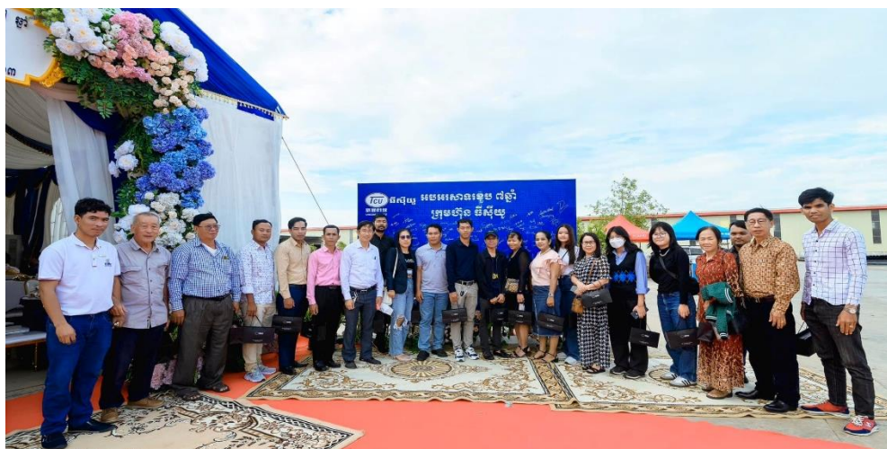
PHOTO 37: A PHOTO TAKEN DURING THE 7 TH ANNIVERSARY OF T.C.U POLYS ENTERPRISE CO., LTD.

CWA signed a consultancy service agreement with T.C.U Polys Enterprise Co., Ltd. to invite members to join the company's 7 th anniversary celebration scheduled for December 23, 2023