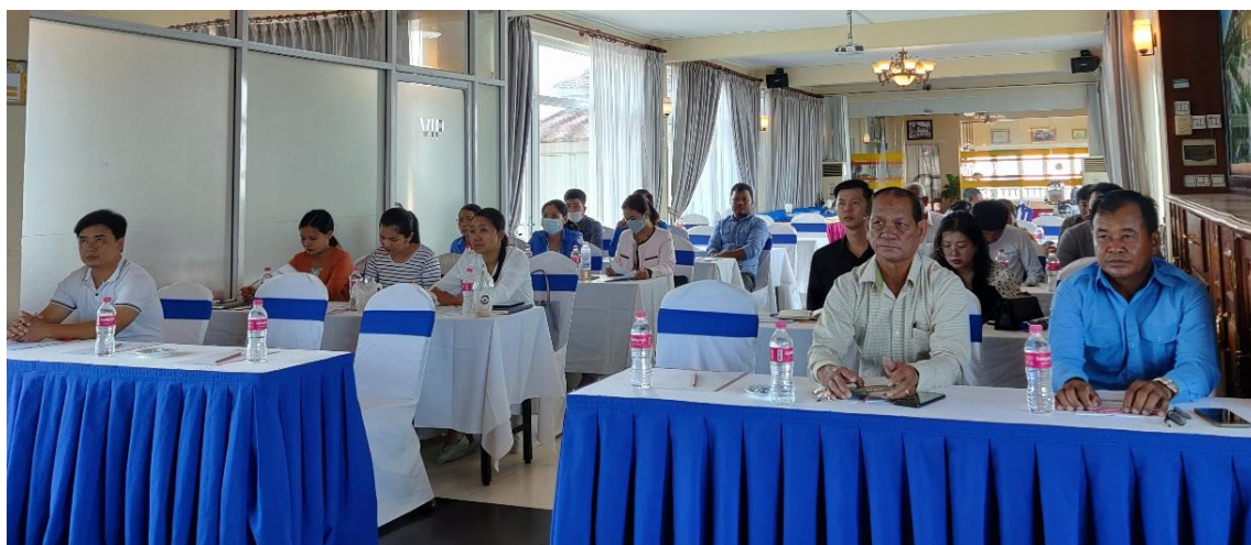
PHOTO 32: TRAINING COURSE ON RIGHT AND OBLIGATION OF TAX PAYER