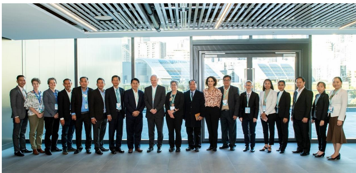
PHOTO 23: AUSTRALIA WATER CONFERENCE AND EXHIBITION (OZWATER'23) IN SYDNEY, AUSTRALIA

On May 9-13, 2023, CWA, together with delegates from MISTI, MRD, the Ministry of Economic and Finance, Phnom Penh Water Supply Authority, Siem Reap Water Supply Authority, the Australian Embassy in Phnom Penh, and the CAPRED program, attended the Australia Water Conference and Exhibition (Ozwater'23) in Sydney, Australia. The purpose was to learn about Australia's water management practices and its support for environmental and economic resilience in the sub-Mekong region.