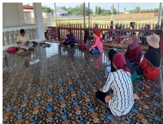
PHOTO 39: END-LINE DATA COLLECTION AT SAMAKI MEANCHEY & KAMPONG TRALACH DISTRICTS