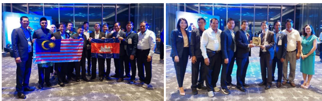
PHOTO 27: RECEPTION DINNER AND BUSINESS MATCHING