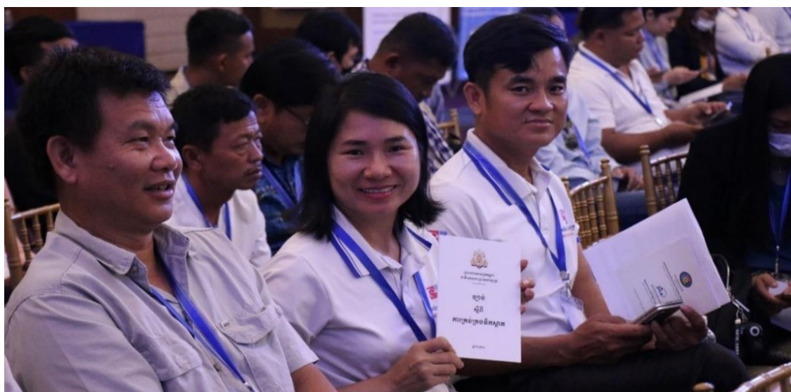
PHOTO 49: DISSEMINATION ON CLEAN WATER MANAGEMENT LAW AT TONLE BASSAC II, PHNOM PENH