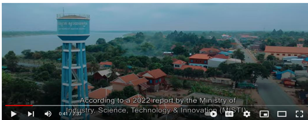
PHOTO 54: PHOTO CAPTURED FROM EDUCATIONAL VIDEO ON THE IMPORTANCE OF PIPED WATER USAGE