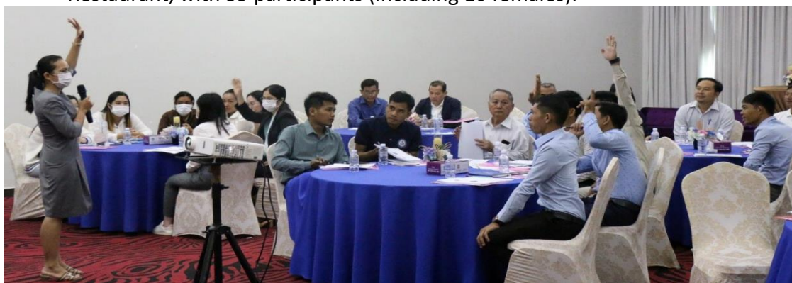
PHOTO 48: TRAINING COURSES ON “WATER SAFETY PLAN” AND THE “5S PRINCIPLE”