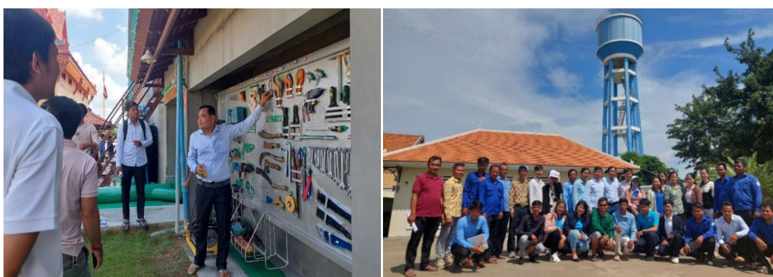
PHOTO 51: STUDY VISIT TO LENG KHEAV PREK AMBIL WATER SUPPLY AND SVAY ROMEAT WATER SUPPLY

CWA collaborated with the General Department of Potable Water and two private water operators, Svay Romeat Water Supply and Leng Kheav Prek Ambil Water Supply, to organize a study visit aimed at acquiring knowledge about water treatment systems and successful experiences in business management.