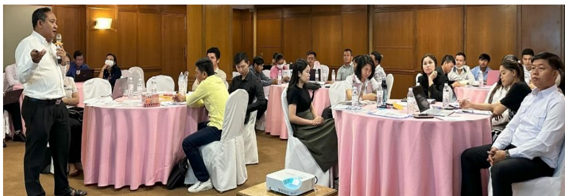
PHOTO 45: PRESENTATION MADE BY SPECIALIST FROM E-POWER CCL Co. LTD.

Participants were from the General Department of Potable Water, Water.org, and 32 private water operators.